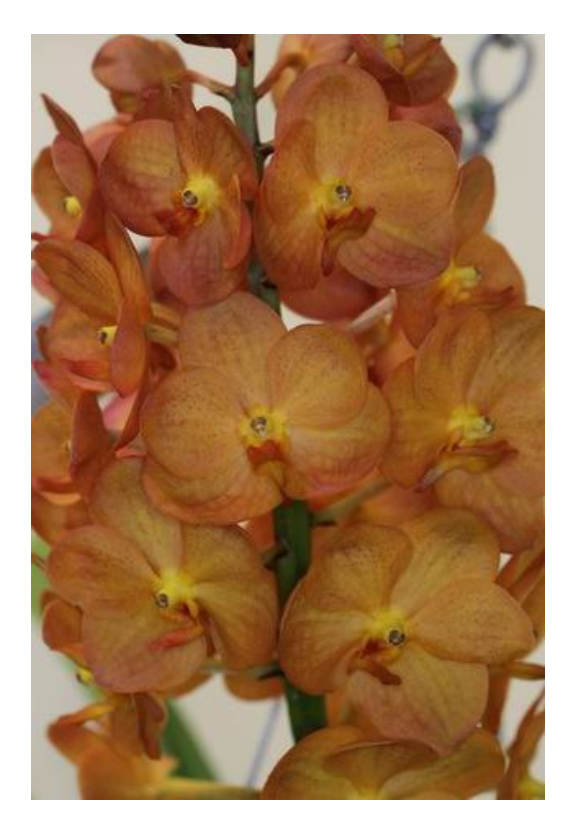
Ascda. Udomchai 'The King'