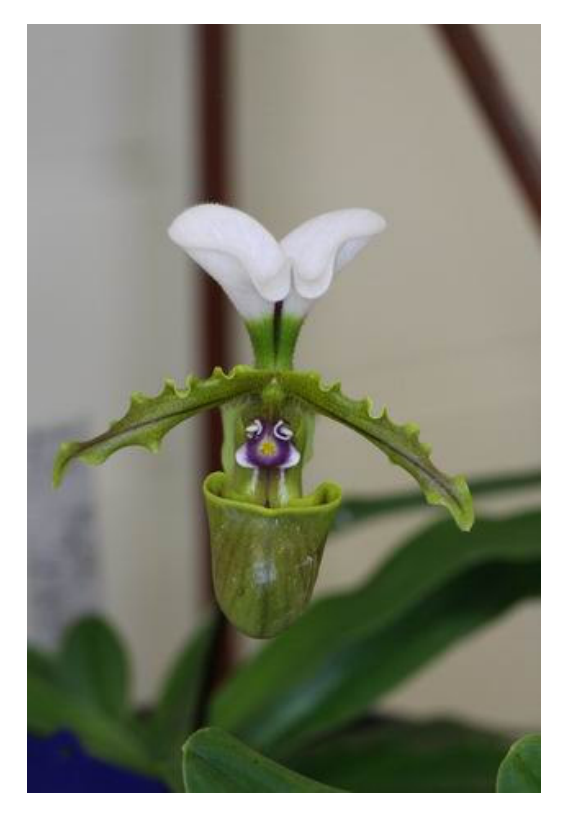
Paph. spicerianum giganteum