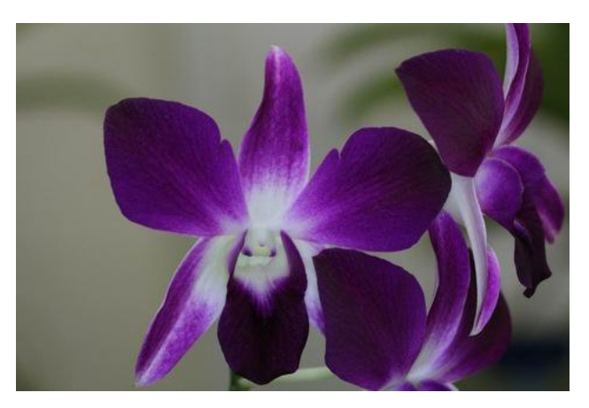
Den. Bom Juri 'Red'