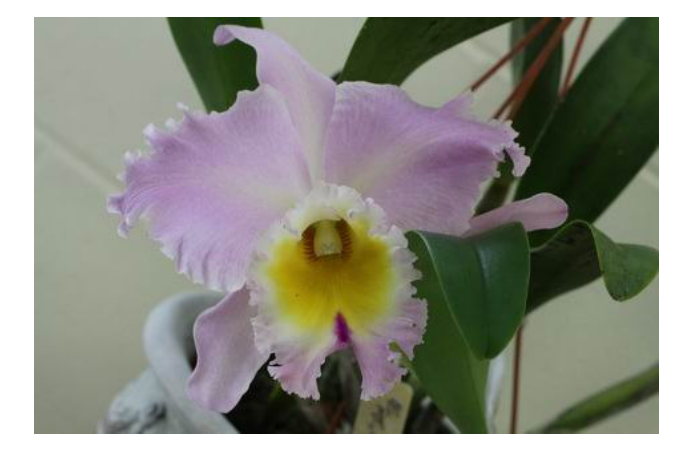
Blc. Mount Anderson