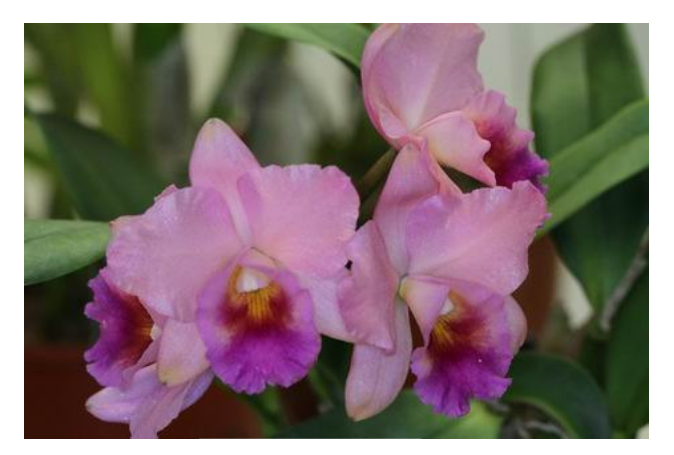
Sc. Dal's Beau