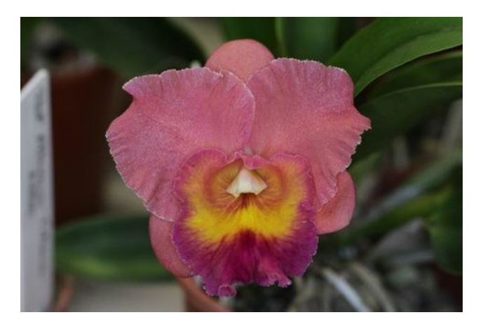
Sc. Dal's Beau 'Ines'