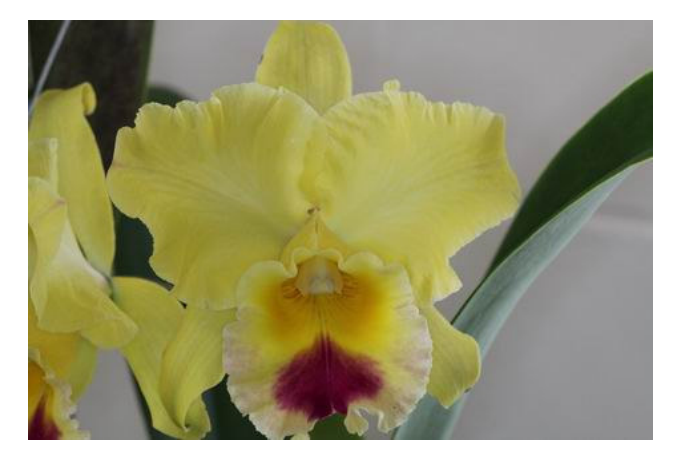
Blc. Goldenzelle 'Lemon Chiffon'