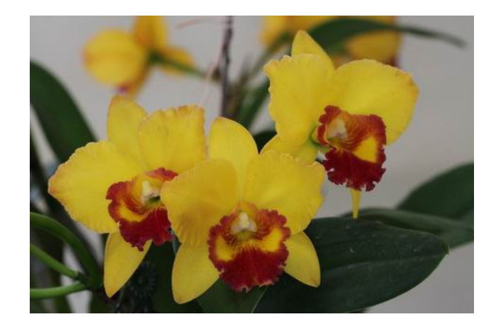
Blc. Love Call 'Rouge'